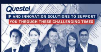
Questel IP and innovation solutions to support you through these challenging times

Get in touch with our partners to find out more.