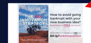
Schweiger & Partners, Singapore The 4x4 Innovation Strategy

mentions our book „4x4 Innovation Strategy”