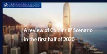
CCPIT CCPIT Patent and Trademark Law Office

In the spirit of bringing together the innovation community during IP Week @ SG 2020, check out what are the IP and innovation products and services from our partners.