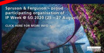
Spruson & Ferguson IP Week Singapore