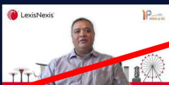
LexisNexis Patent Management: Uncovering Cost-Savings in Your Portfolio

mentions our book „4x4 Innovation Strategy”